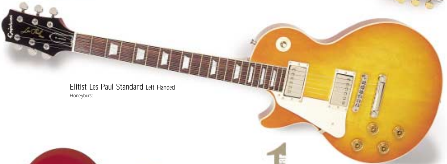
Elitist Les Paul Standard Left-Handed