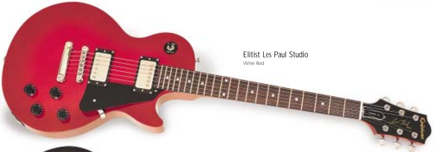
Elitist Les Paul Studio Wine Red