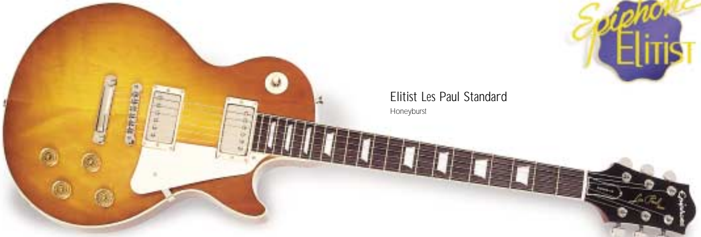
Elitist Les Paul Standard Honeyburst