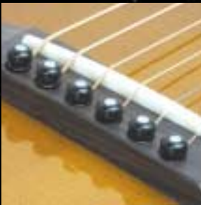
Bone Nuts and Saddles.