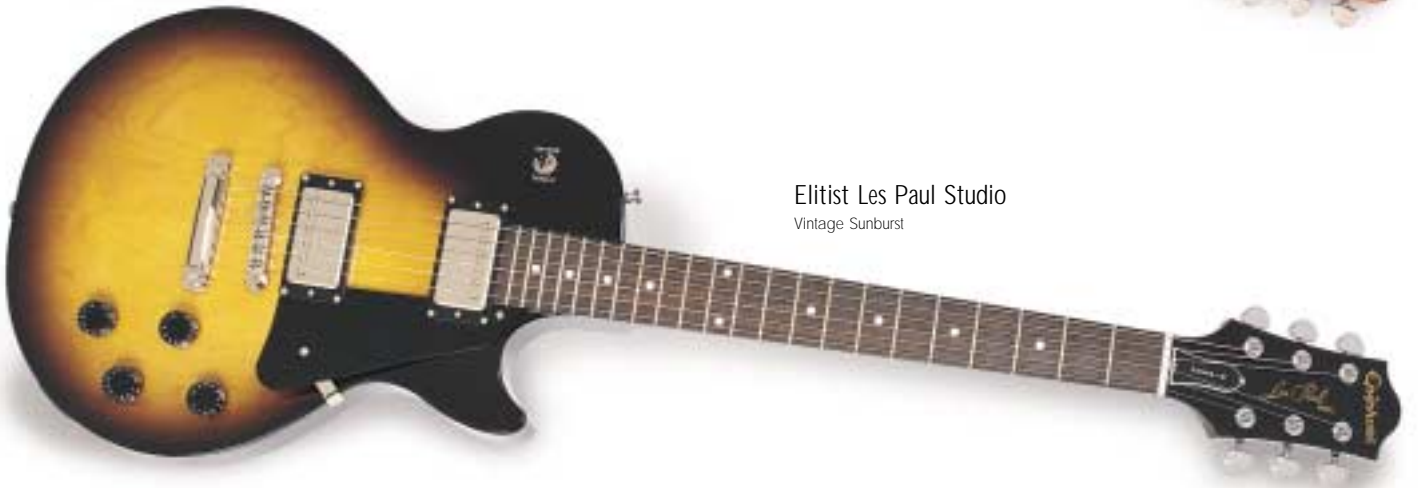
Elitist Les Paul Studio Vintage Sunburst