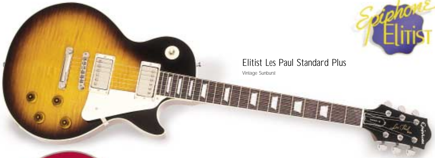
Elitist Les Paul Standard Plus