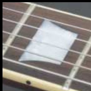
Real Abalone and Pearl Inlays.