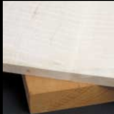
Since 1873, Epiphone has been perfecting the art of wood selection.

D esigned for the professional musician, the new Elitist line from Epiphone combines over 125 years of instrument building experience and expertise with the finest materials. The results are instruments of impeccable quality and beauty.