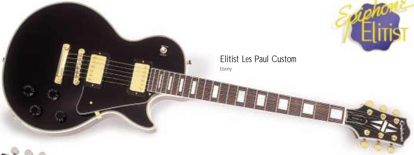
Elitist Les Paul Custom