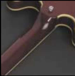
One-piece Mahogany necks: hand-shaped for all-night playing ease and comfort.