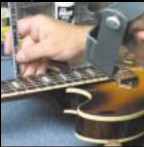
Meticulous Adjustment and Set-up.