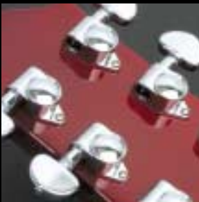
Quality begins with great hardware. The Elitists feature precision Grover™ machine heads for unsurpassed tuning stability.

The Elitist Bodies All Elitist bodies are made from the finest tone woods such as African Mahogany and individually selected for their weight and tonal qualities. They are then cut and book-matched to perfection.