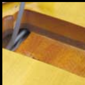
Book-matched Maple tops with real Mahogany backs combine for the perfect tonal response.