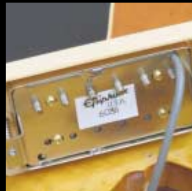
Pickups "Made in the USA" exclusively for Epiphone by Gibson Musical Instruments.