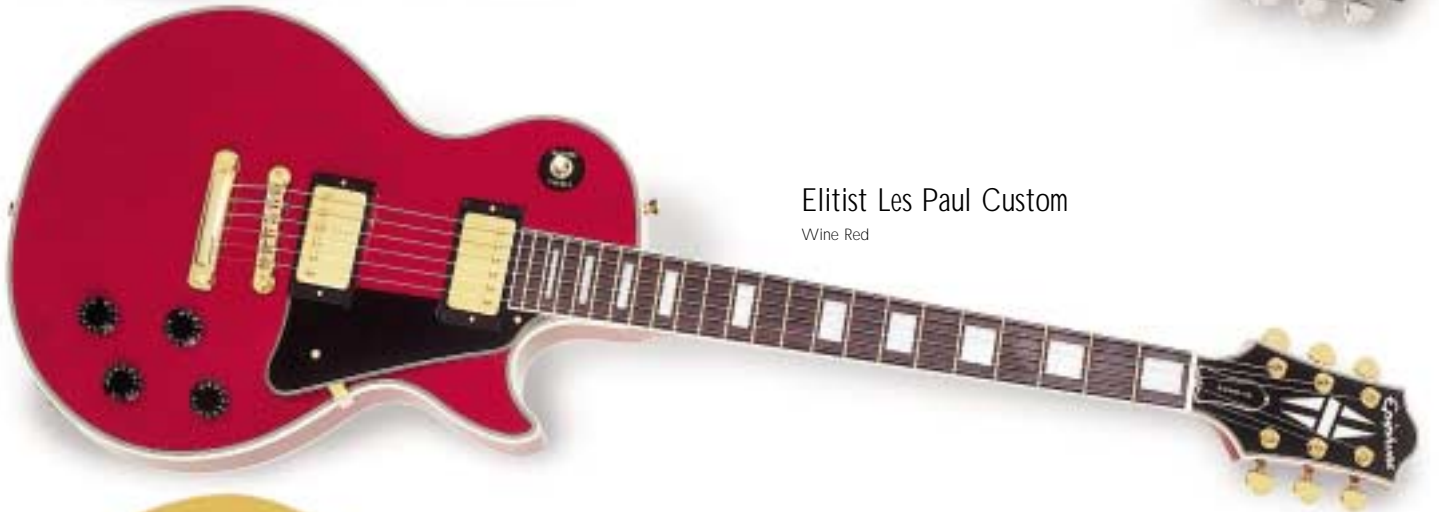
Elitist Les Paul Custom