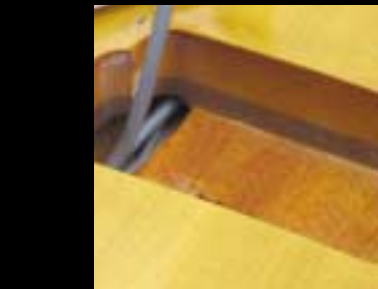
Book-matched maple tops with real Mahogany backs combine for the perfect tonal response.