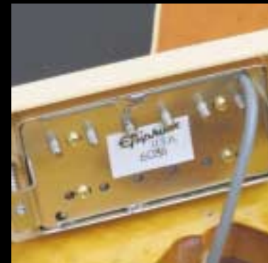
Pickups "Made in the USA" exclusively for Epiphone by Gibson Musical Instruments.